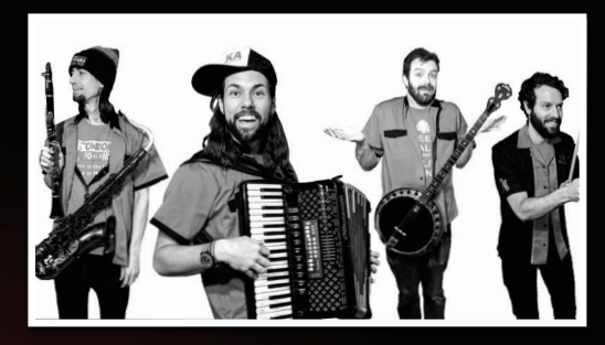
CHARDON POLKA BAND @ 1:00