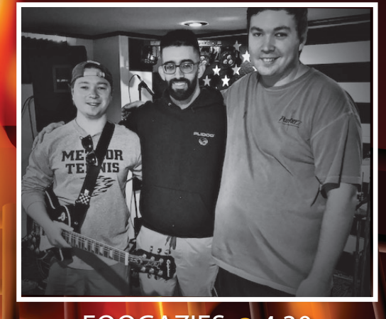
FOOGAZIES @ 4:30