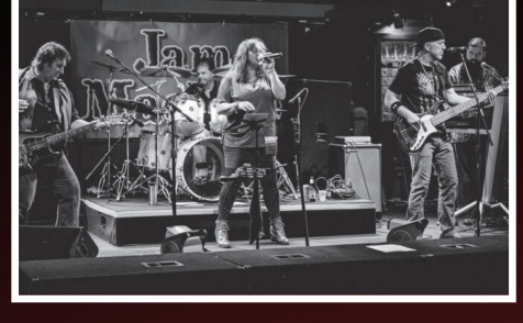
JAM MACHINE @ 1:30