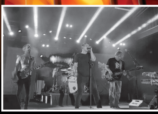
STADIUM ELEVEN @ 7:30