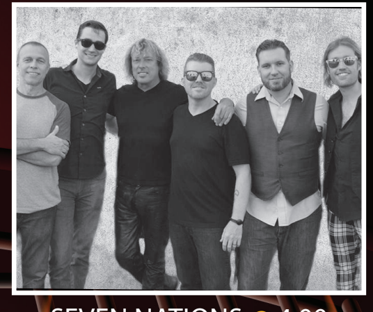
SEVEN NATIONS @ 4:00