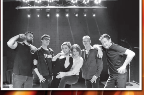
FOLLOW THE SUN @ 4:30