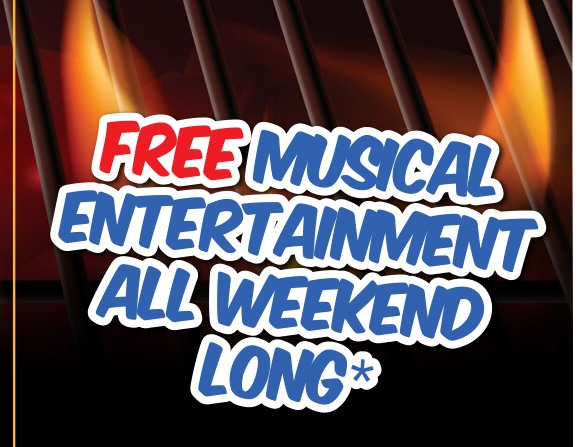
*With Paid Admission to the Berea's National Rib Cook-Off & Beer Fest. Performance & attraction features & times are tentative & subject to change.