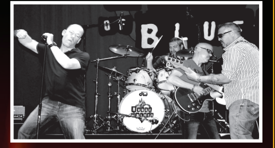
THE TINY HANDS BAND @ 1:30